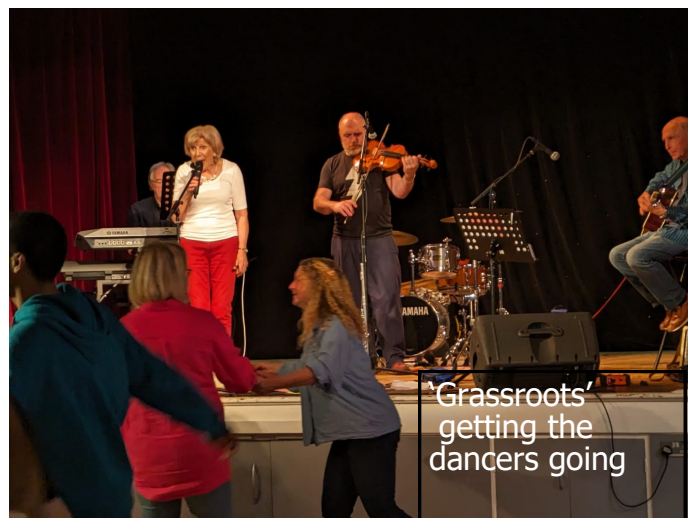
'Grassroots' getting the dancers going